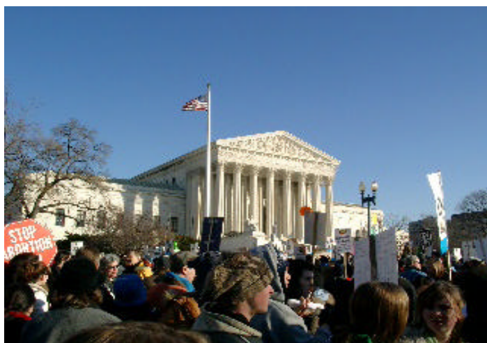
Peaceful and tired, marchers arrive at the Supreme Court steps