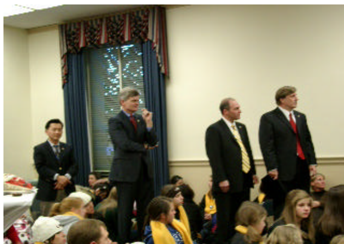
Congressmen Cao, Cassidy, Scalise & Fleming awaiting turn to speak