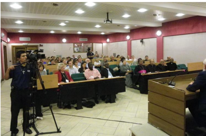
Fig. 2. The conference hall.

Mothers and of Their Obstetricians: Who on Earth Cares?" Attending were ob-gyns and other interested health professionals from a number of European countries, the U.S., Australia, Japan and Africa, to hear speakers from the U.K., Ireland, the Vatican, Italy, the U.S., Nigeria, Switzerland, Australia, Poland, Italy, Canada, and Japan (Fig. 2). The latter included - in addition to physicians,