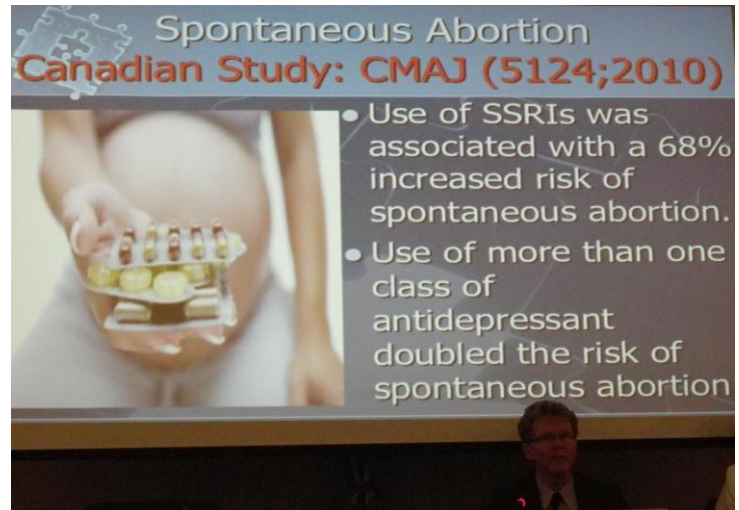
Fig. 4. Risks of prescription anti-depressants in pregnancy.

contraceptives and cervical cancer – which which is summarized in the "Letter to the Editor" published in The Advocate of Baton Rouge on October 8, 2011 – actually from information obtained at more than one meeting – (see p. 4), and on the use of psychiatric drugs in pregnancy (Fig. 4). Overall, the meeting was very successful, not