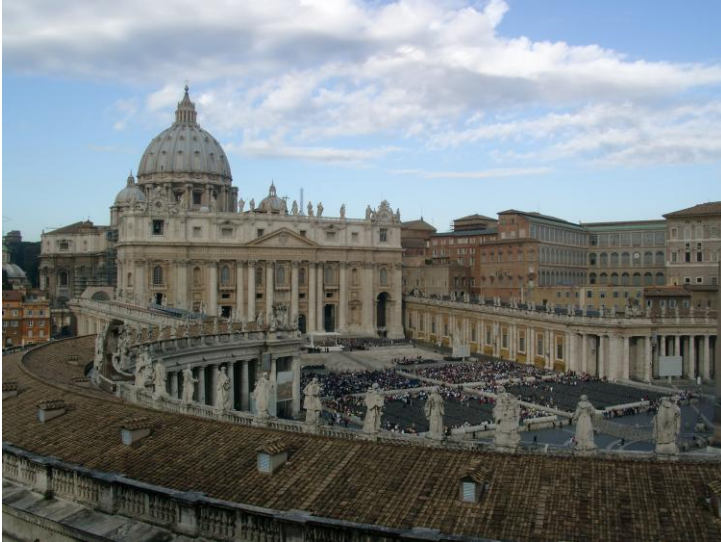
Fig. 1 View from roof of Conference venue, where most evenings were for socializing.

The 8 th International MaterCare Conference of obstetricians and gynecologists, sponsored by the International Federation of Catholic Medical Associations (F.I.A.M.C.), was held in Rome, Italy August 31-September 5 th , just across the street from St. Peter's Basilica (Fig. 1), with a theme of "The Dignity of